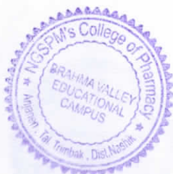
Dr. Vijay. D. Wagh

Trees are an investment and it will provide environmental, economic, and social benefits throughout its lifetime. Plants and trees are helpful in mitigation of Environmental pollution. Not only provides shade but also improves aesthetics and air quality inside the campus. Majority of students go through anxiety and panic attacks due to exam stress. Planting trees may take charge of increasing focus on lowering stress levels and improving mental health. The Management has taken more landscaping with trees and concern about the plants by conducting more plantation programmes organized in a huge manner.